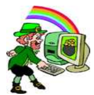
Happy St Patrick's day

Got any stories about the past regarding a NJORTC event, preferably with pictures, that you would like to tell us about? Write them up and send it to me along with the pictures and we will use it in the newsletter.