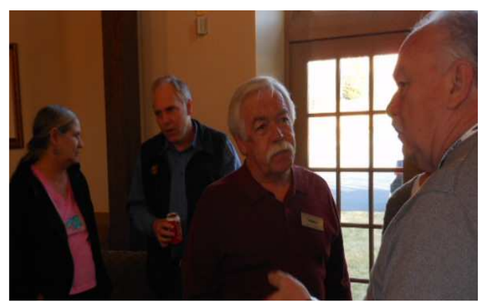
Continued from right

If it is dry or its teeth are stripped, the speedometer will not register correctly. The transmission-mainshaft nut must be tight or the drive gear may slip on the mainshaft, causing inaccurate speed readings. From the Early Bird