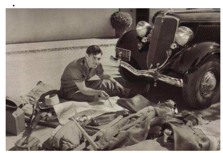
Recognize this guy with his 34 Ford?