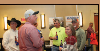
Acker Drill Company.