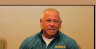
What a team!