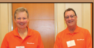
What a team!

Surface • Borehole • Marine Groundwater Exploration Engineering Geophysics Remediation & Void Detection Dam & Levee Assessment Oil & Environmental Characterization Petroleum Exploration