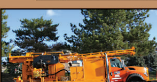
CME had a rig on display.