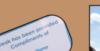
Break has been provided Compliments of