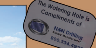
The Watering Hole is Compliments of N&N Drilling