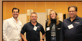
The Eijkamp SonicSampDrill Team enjoyed the event.