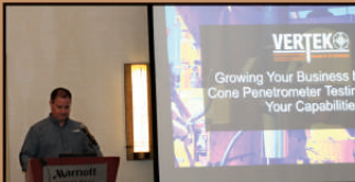
SEDC featured some great presentations.