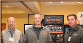
What a stellar group at the Geoprobe® booth.