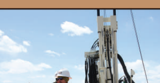
Drilling Boot Camp