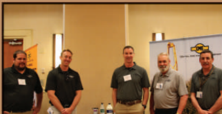
It's always great to see the CME Crew.